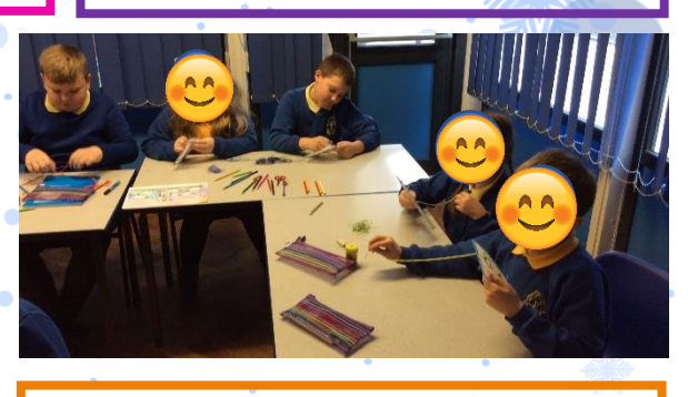
Foundation stage have been paper weaving and have made paper baubles and decorated