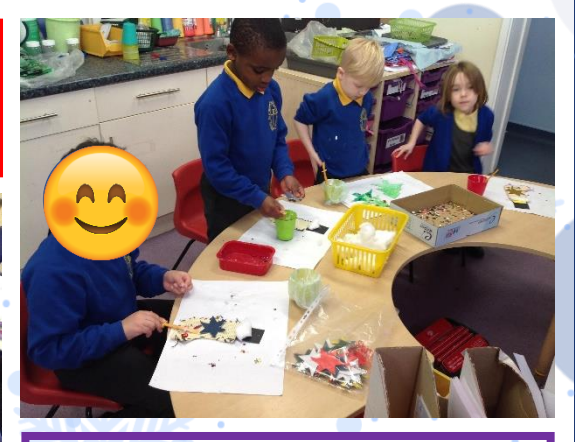
Year 3 have made finger puppets based on the Christmas story and used the running stitch